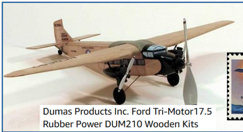
Dumas Products Inc. Ford Tri-Motor 17.5 Rubber Power DUM210 Wooden Kits