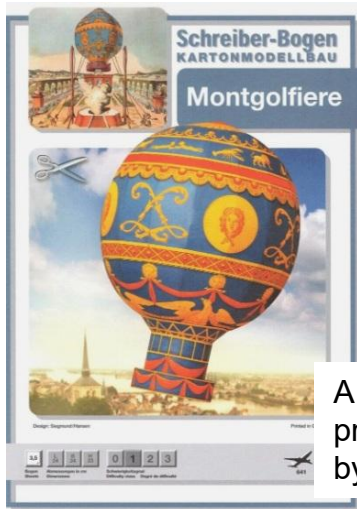
A balloon model made from printed card stock, offered by a company in the UK.