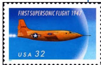
Revell 03888 Bell X-1 Supersonic Aircraft