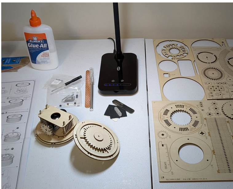
Assembly of the Tower began with the motorized base.

The kit is going together much better than I expected for something made in China with thin wood. The music box must be wound using the key in the bottom of the base, which not the best design but workable.