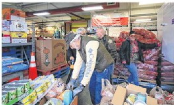
Local pantries see more demand for help with food

On the front page of Saturday's The Republic , an article about the rise of hunger in Columbus reported the volume of food being distributed by Love Chapel and the Salvation Army. 11/30/2024